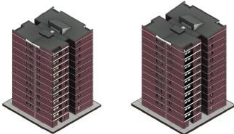
EXISTING NORTH WEST