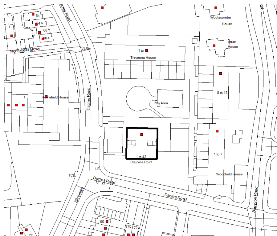
Figure 1 Site Location Plan